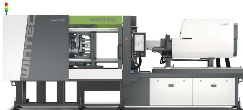
Image 01: The all-electric e-win 1800 combines a compact design with high cost-efficiency for productive high-volume manufacturing.

Following its successful European premiere at K 2025, the WINTEC e-win 1800 now makes its debut in Istanbul. This machine combines a compact footprint and high precision with an attractive price-performance ratio. The WINTEC brand specifically targets users who need robust standard